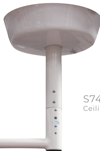
S740LC Ceiling mounted