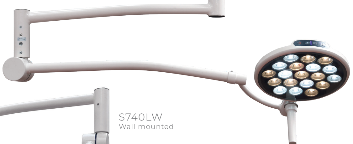
S740LW Wall mounted