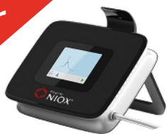
NIOX VERO Testing Device